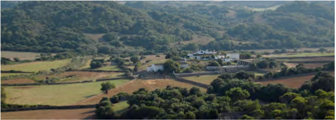
“Alfurinet” Farmhouse with 500 acres of private land