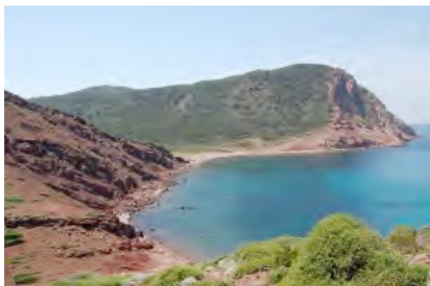
Private Cove (30 mins walk)

Everyone. Mindfulness Meditation has known to benefit people with a variety of health problems such as stress, anxiety, proneness to depression, and chronic pain. However, Mindfulness can also be helpful for people who have no obvious health concern and simply wish to explore a new way of relating to one's thoughts and emotions and the interaction between the two. We all go through times in our life when certain events place a great stress on our body & mind. These times may have been caused by specific demands or because of a new illness that we find hard to cope with. Mindfulness Meditation cannot remove the stressors or may not cure ones illness. However, it can help one to develop a new way of dealing & coping with pain or stress on a cognitive and experiential level, thus perhaps making it feel much easier to cope with our stressor.